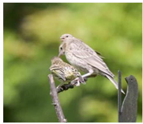
A Siskin family — adult and fledglings.

But other birds are abundant — Chickadees, Nuthatches, Pine Siskins, Juncos, Sparrows, Towhees, Robins, Stellers Jays, Northern Flickers, House Finches and Hairy Woodpeckers. There is much beak-to-beak feeding.