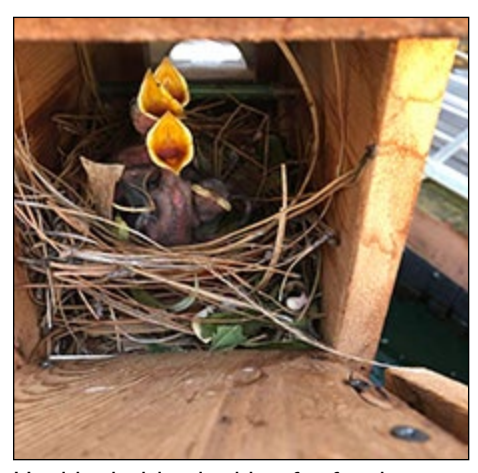
Healthy babies looking for food.

Adult Purple Martin in the sun checking out housing, May 8.