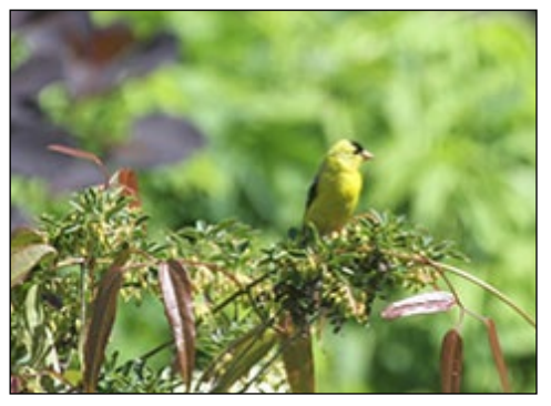
I'm going to miss our bold, yellow Goldfinches when summer ends.

only a few juvenile and female humming-birds going from blossom to blossom.