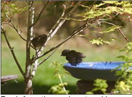
mer is changing by Fresh from the pool, wet and happy.

Everywhere we turn now, birds are playing in the water. We have four bird baths and, at times, all four are in use. That's what a hot, dry summer will do for you. The rhythm of our summer is changing by the week. The dawn